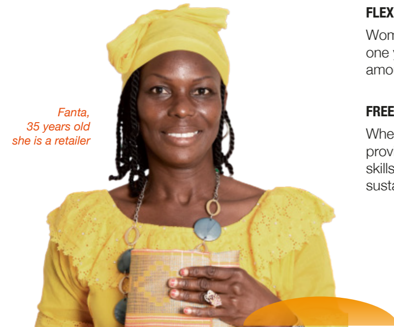
Fanta, 35 years old she is a retailer