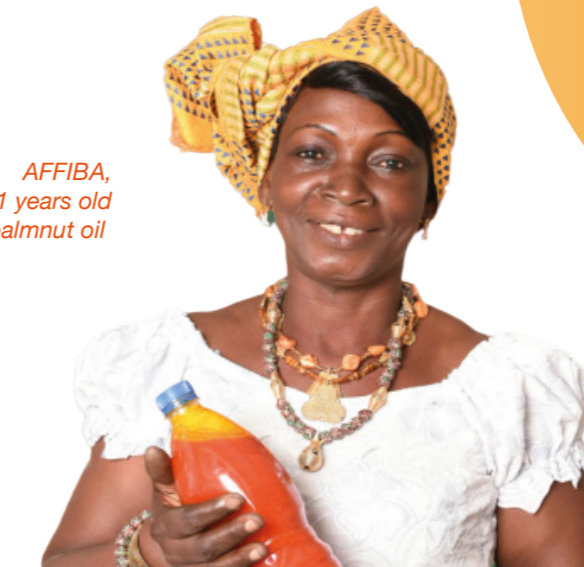
AFFIBA, 51 years old she sells palmnut oil